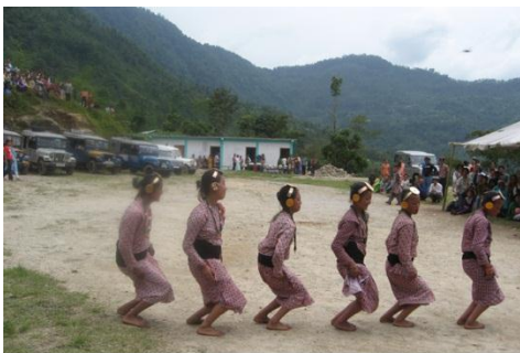
Village children perform a Nepali folk dance

The weather gods also seemed happy with the villagers of Dukka as we were blessed with a bright sunny day on the 29 th of May 2009. The villagers had dressed themselves in their traditional attire and were standing on the sides of the road built by them to greet guests. How happy and proud they were as they had accomplished a great job which the government had not been able to do. Their joys could be easily seen on their faces. Tiny colourful paper flags on the road sides fluttered as if to convey that they too were proud of this place.