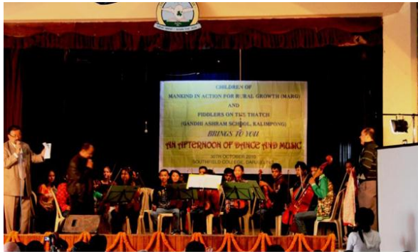
MARG welcomes members of Fiddlers on the Thatch

October the 31st, 1:15 pm, I'm on a flight on my way back to Delhi having left my beloved hometown Darjeeling early this morning. Reminiscing with my wife about the event we were involved in yesterday, the 30th of Oct 2010. "An afternoon of