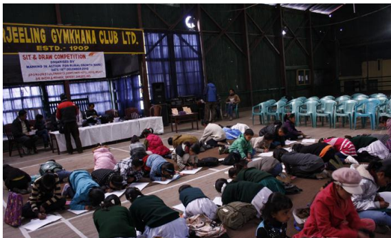
Juniors at the contest

Mankind in Action for Rural Growth (MARG) organised a Sit and Draw Competition for the children of Darjeeling. We chose this time of the year as most of the schools are closed for winters and the privileged children and families move to warmer places.