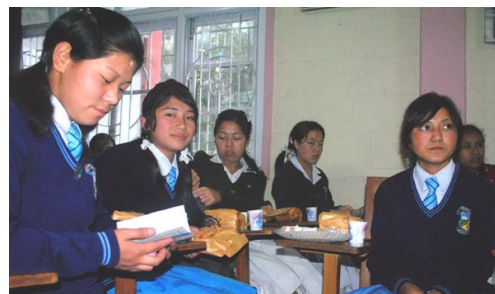
Admiring the new Pass Book