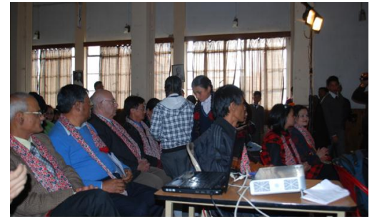
Some of MARG's guests on 30th October 2010